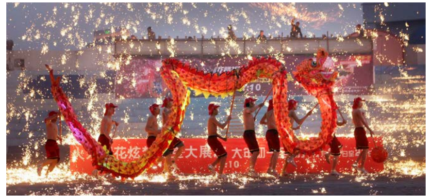
The Chinese New Year celebration lasts two weeks and includes dances such as this fire dragon dance.

The ancient Chinese were also the first to make fabric from silk . It became the country's most popular export for many years. People traveled from around the world on a trade route called the Silk Road to get it. The fibers used to make silk come from the cocoons of silkworms. The ancient Chinese discovered they could separate the fibers from the cocoon. Then, they spun the fibers together to make a strong thread. The thread was woven together to make beautiful cloth.