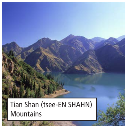
Tian Shan (tsee-EN SHAHN) Mountains