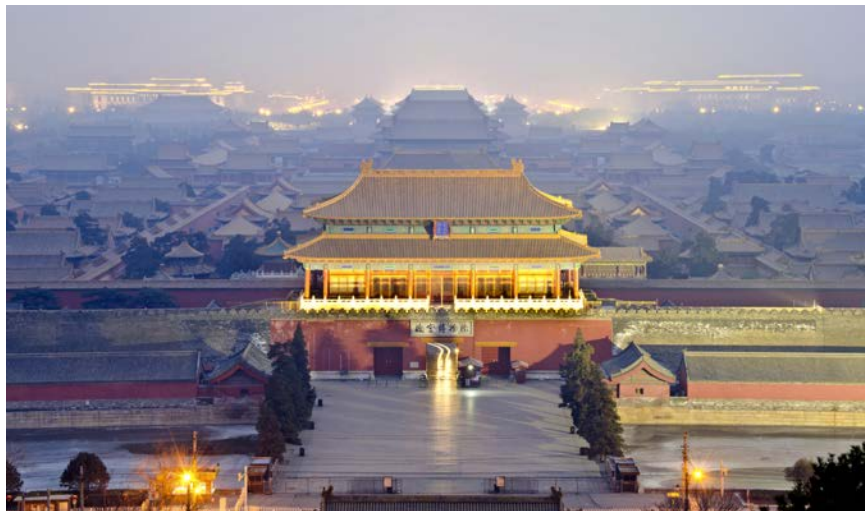
The Forbidden City in Beijing was built in the early 1400s, and first housed the emperor's family in 1420.

China has several large cities, including Shanghai, Beijing, and Hong Kong. Beijing, the capital, is located in northeast China. Its name has changed many times, yet Beijing is one of the oldest cities in the world. It is over three thousand years old. More than fifteen million people live there today.